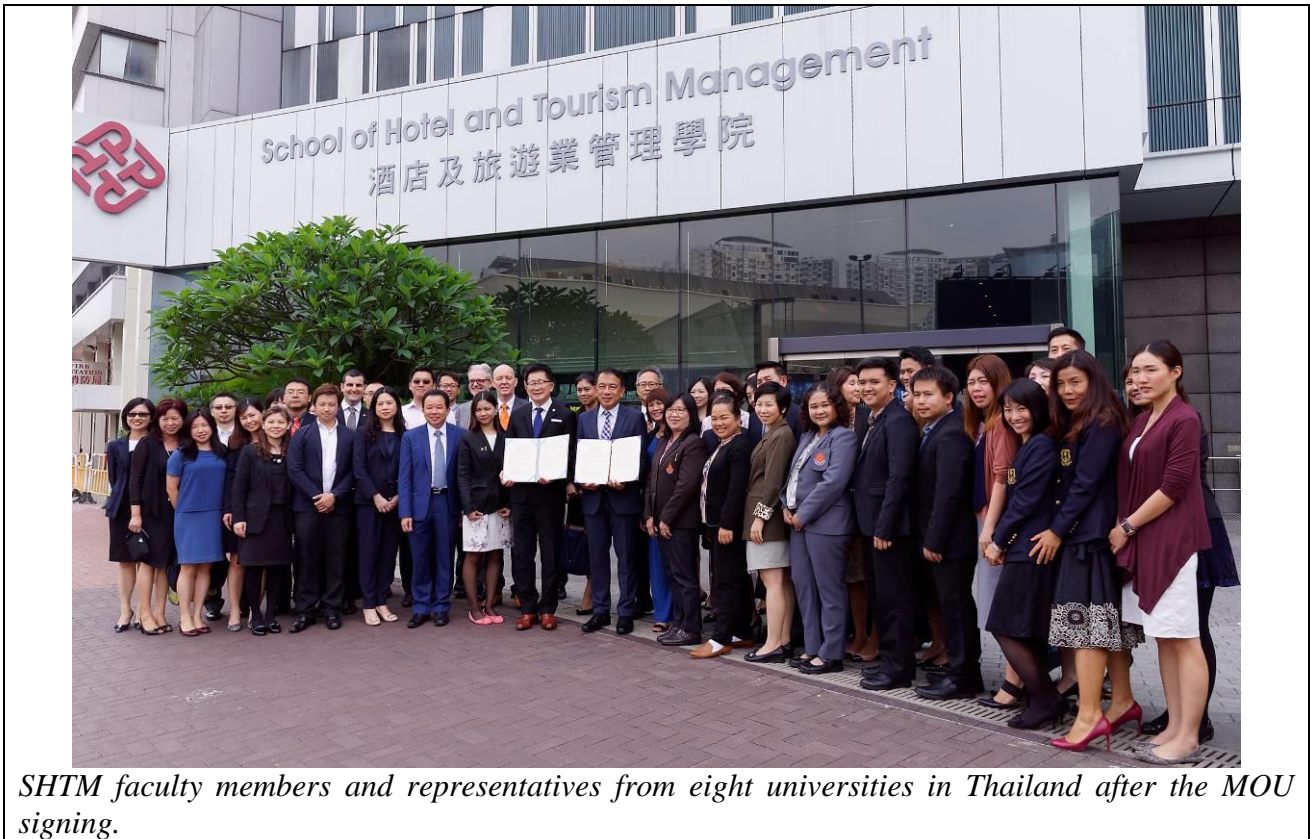
SHTM faculty members and representatives from eight universities in Thailand after the MOU signing.